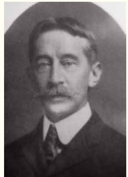
George Bird Grinnell was a writer for Field and Stream and strong supporter of the park and its wildlife.